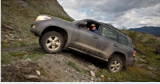
Land Cruiser shown in Magnetic Grey Metallic with available Land Cruiser shown in Megnetic Gray Metallic with Available Prototype vehicle shown with optional equipment. Production Upgrade Package