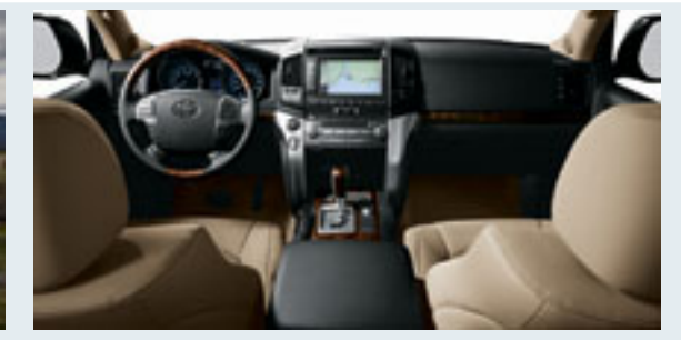
model may vary